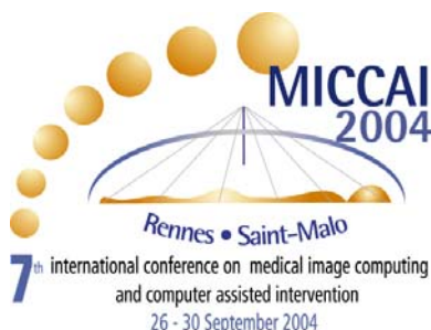
Exhibit Space Reservation Form